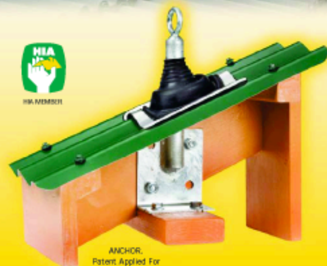
ANCHOR, Patent Applied For 2006200720

Proudly Australian Made, by an Australian Company, using Australian Products