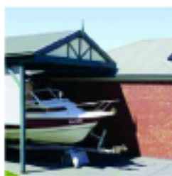
BRACKET, Patent Number 307335

This adjustable bracket solves the problem for larger vehicles, boats and caravans by lifting the height of the pergola or carport that is attached to the main roof not the fascia.